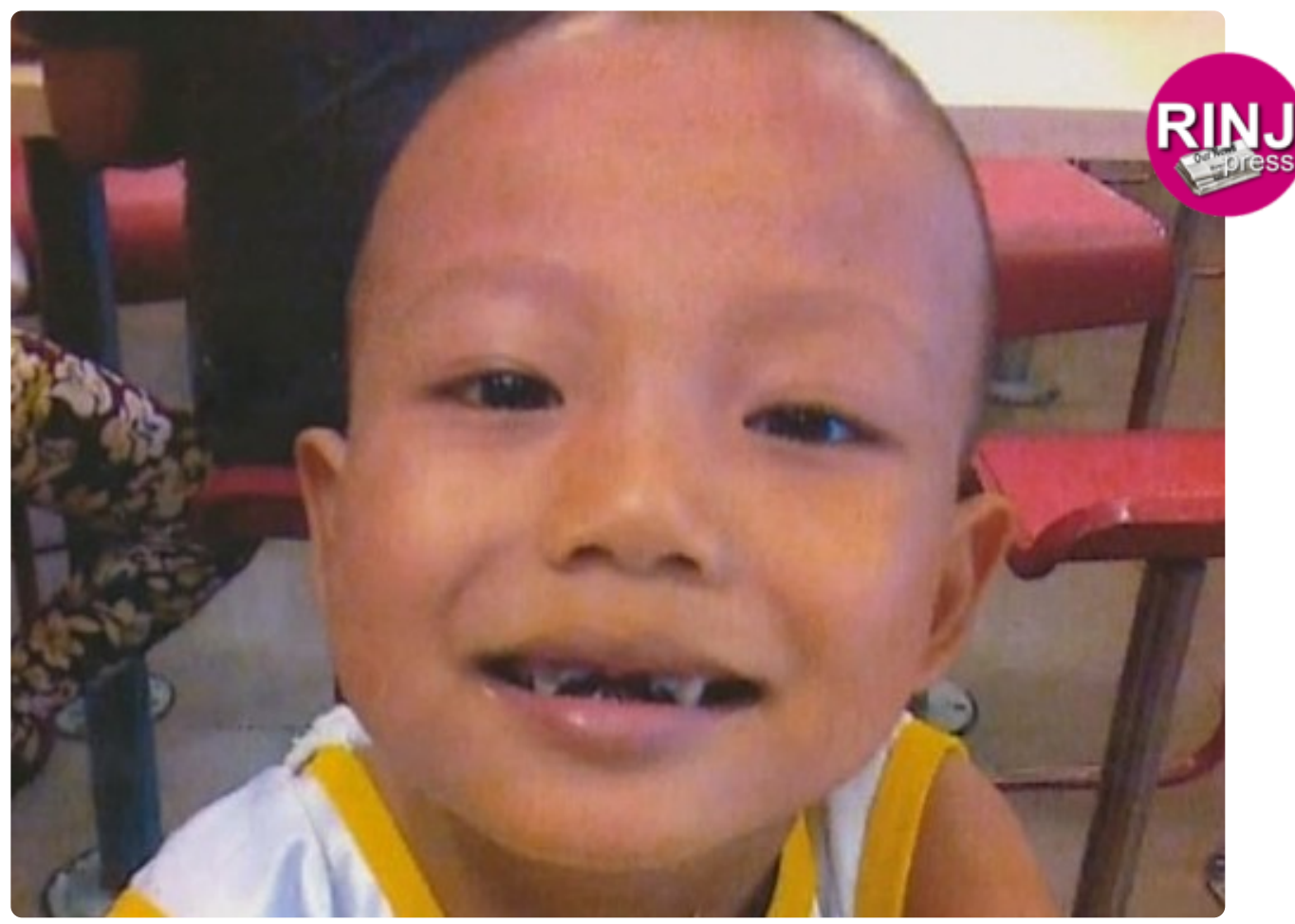
The RINJ Foundation global women's group has urged the Philippines to end extrajudicial killings, enforced disappearances, illegal arrests and detention, torture and harassment.

RINJ has further urged the Philippines to begin accepting responsibility for the safety of children and their families.