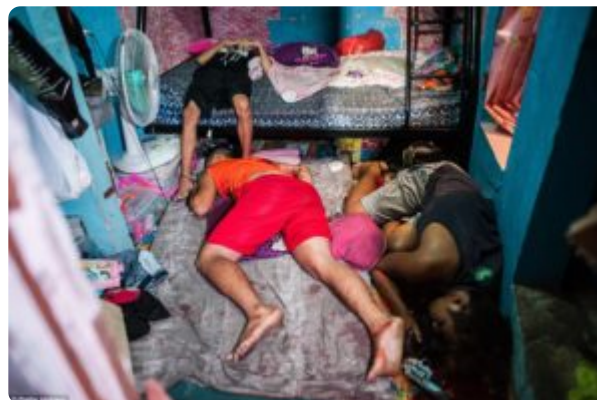
These people were killed by a death-squad.

However they are treated , their plight is real. If you share some food, they will gratefully go away and eat. If they are starving and unsuccessful in gaining food they will rob you or commit other crimes. Prostitution at all ages is a common one.