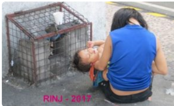
One of the saddest scenes you will see. Both of these humans need our help.

They live among rats and cockroaches that outnumber them in the race for a scrap of food or drink.